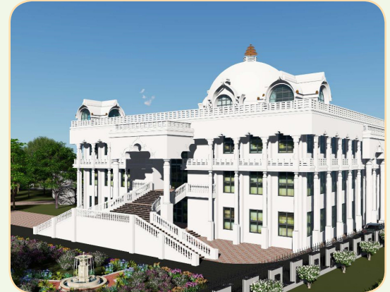
Proposed Dr. B. R Ambedkar Museum & Library, K.U. Dharwad